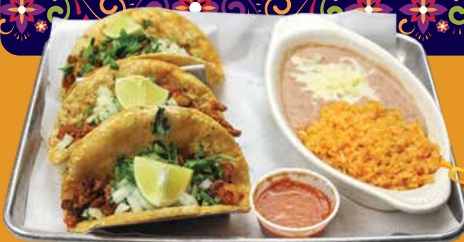
Gringo Style Soft Flour