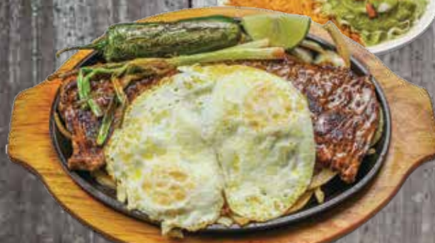
QUE PASA CARNE ASADA