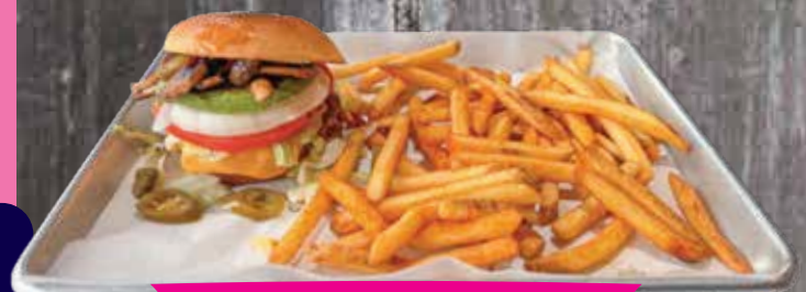
New! QUE PASA BURGER