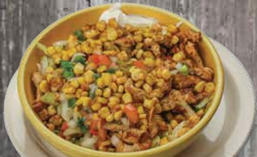
CHICKEN RICE BOWL