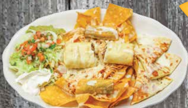
QUE PASA SAMPLER