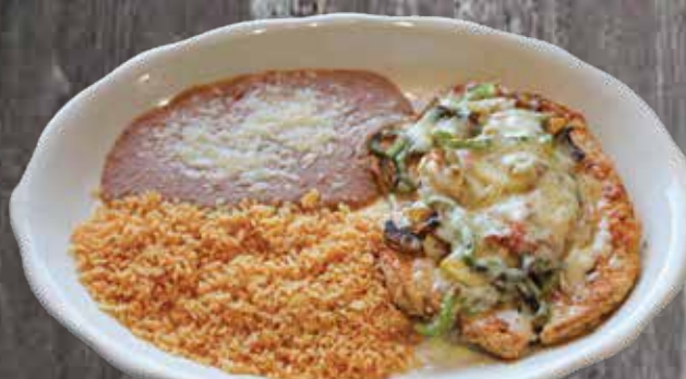
NEW! POLLO SANTA FE