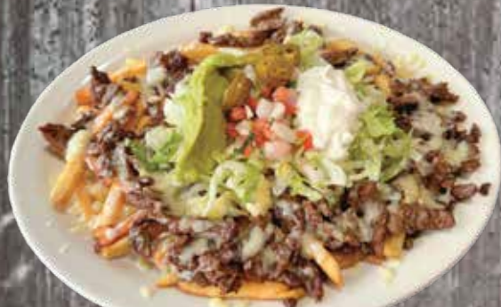
NEW! STEAK & FRIES