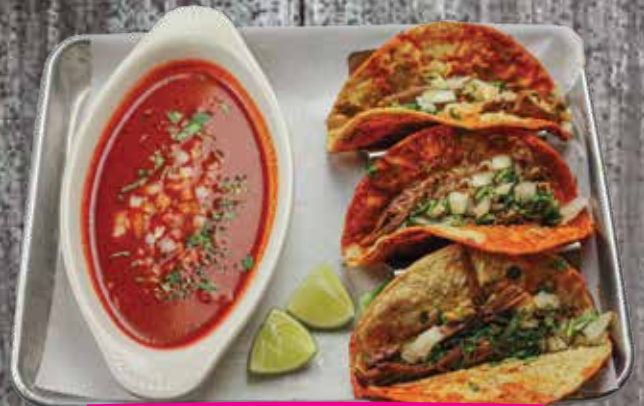
QUESA TACOS DE BIRRIA