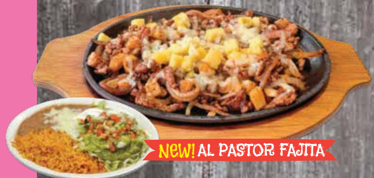
NEW! AL PASTOR FAJITA