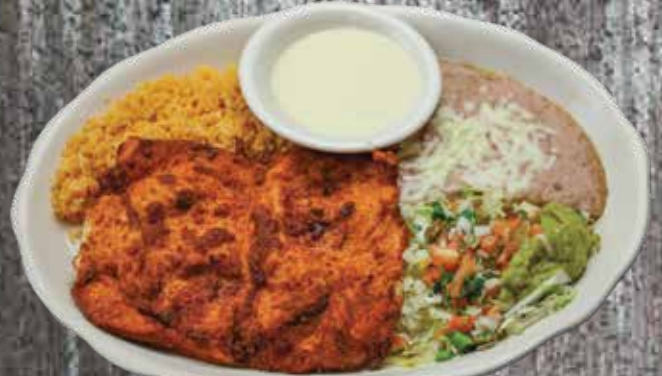
MILANESA DE POLLO