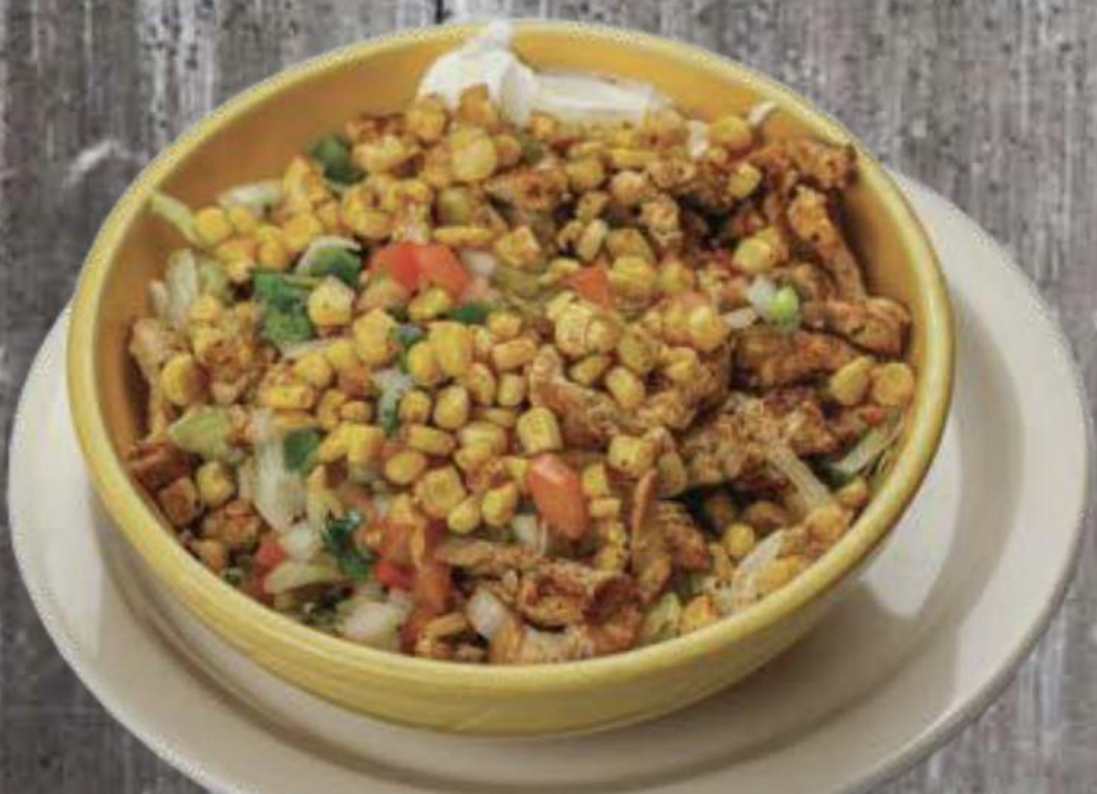
CHICKEN RICE BOWL