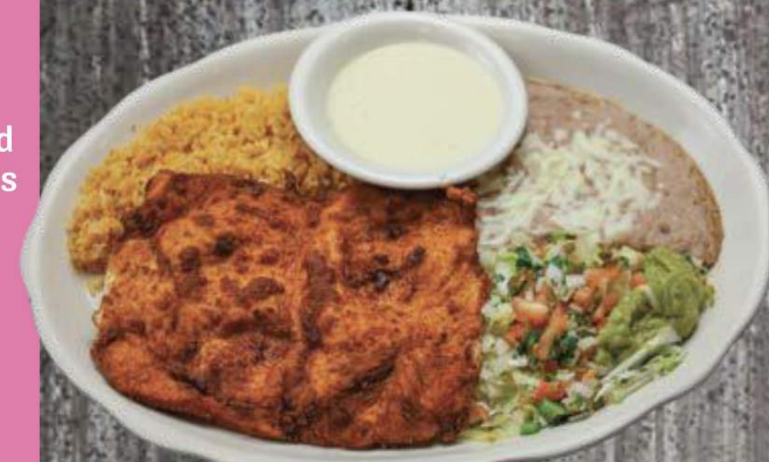
MILANESA DE POLLO