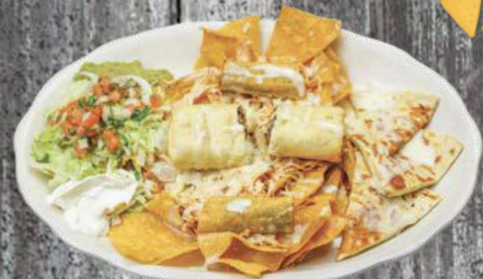
QUE PASA SAMPLER