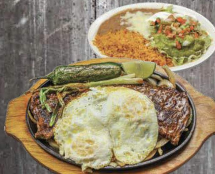
QUE PASA CARNE ASADA